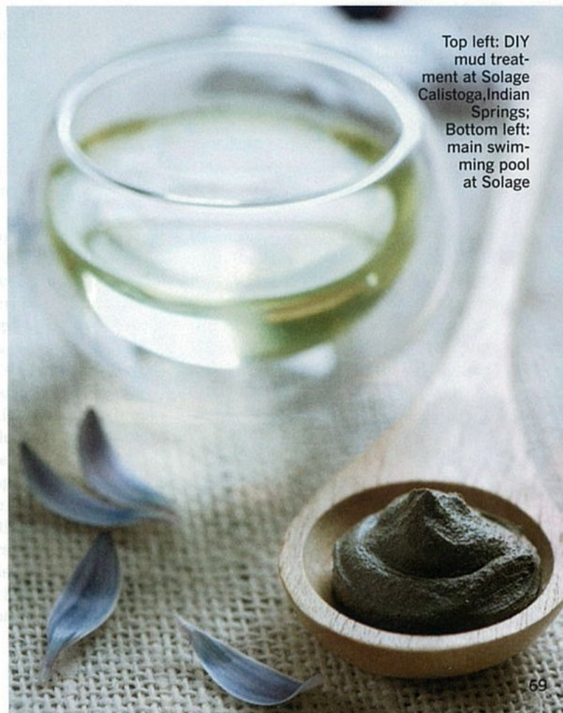
Top left: DIY mud treatment at Solage Calistoga, Indian Springs; Bottom left: main swimming pool at Solage