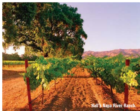
Hall's Napa River Ranch.