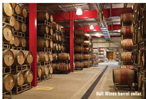
Hall Wines barrel cellar.