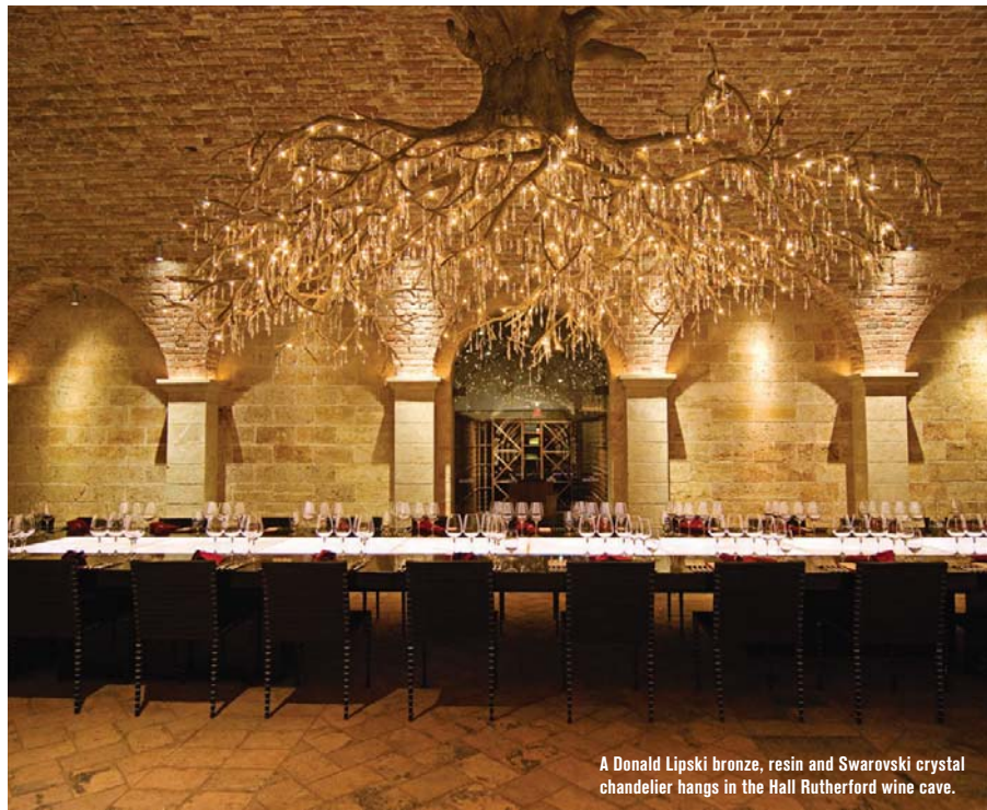
A Donald Lipski bronze, resin and Swarovski crystal chandelier hangs in the Hall Rutherford wine cave.

With ambrosia-rich scenery, so much wine you sweat red and a legendary food scene, relaxed Napa Valley offers a compelling excuse for early retirement. But for several Dallas denizens, the region has sparked new vino ventures. Swept up in a grape passion, a few of our lucky neighbors are testing the soil in the resplendent California wine country, and the fruits of their labor are paying off big.