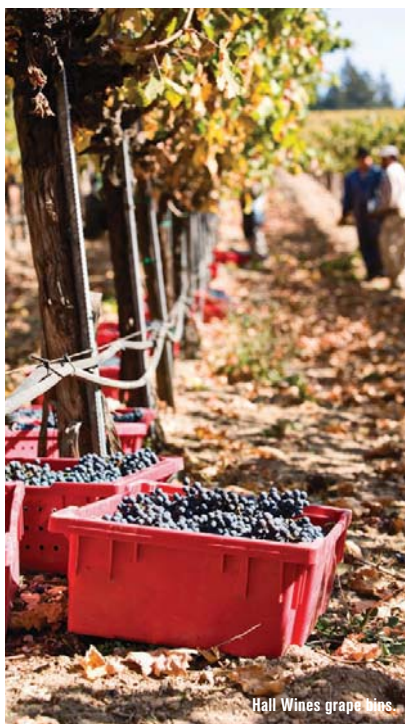
Hall Wines grape bins