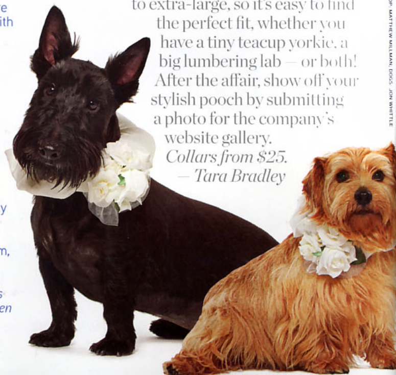
TOP: MATTHEW MILKMAN/DOGS; JON WHITE