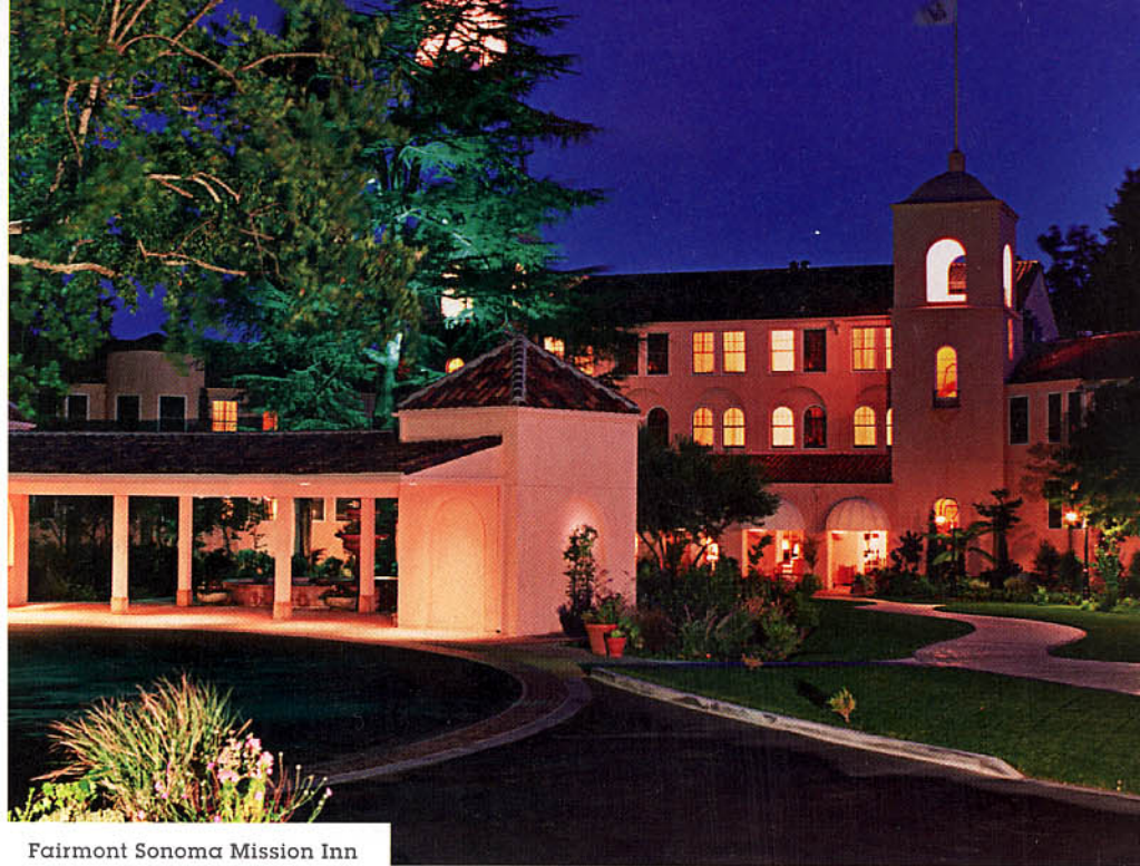
Fairmont Sonoma Mission Inn

Of course, you're really expecting wine while in Napa, and you'll find no shortage of new venues in which to indulge. Set inside a 1904 stone manor listed on the National Register of Historic Places, newcomer Ma(i) sorry has been making a splash with its "living gallery" approach. What feels like an estate or private club is home to rotating collections of art, private tasting rooms and public lounges stocked with limited production boutique wines. Also worth a stop is the Girard Winery's sleek new tasting room, which opened one block up and has become known for its bold Cabs and, of all things, its designer restrooms.