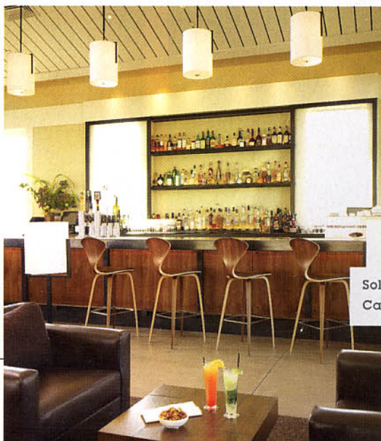
SolBar at Solage Calistoga

Galerie, a new private dining experience at Auberge du Soleil that features local and national artists along with views of the valley. solagecalistoga.com :: aubergedusoleil.com