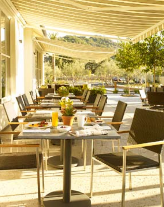
Carbon-filtered water is dispensed from systems at the Solbar restaurant and Spa Solage, eliminating the need for bottled drinking water.

individual cottage-style apartments. Warm palettes with a nod to nature (greens and browns abound) set off furnishings upholstered in neutral wool fabrics and finished with nontoxic varnishes. Paints low in VOCs (volatile organic compounds) were used so they would not emit harmful gases. Wherever possible, reclaimed and sustainable materials were installed—hemp draperies adorn spa windows and bamboo and reclaimed cedar were used in public spaces. And, of course, there's the pampering element. ▶