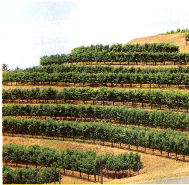
Pride Mountain Vineyards in Napa Valley