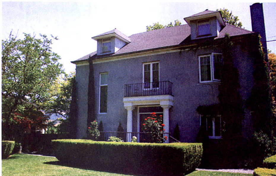
Exterior, Chateau de Vie