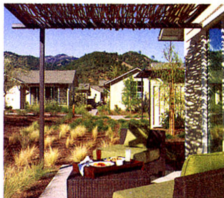
Private patio at Solage

A memorable way to experience the local scenic beauty is by air with Calistoga Balloons ( www.calistogaballoons.com ). Take in the views of Mt. St. Helena and the adjacent Palisade Cliffs as you ride the early morning ribbons of warming air over the Napa Valley. Staying closer to land, Solage guests can take advantage of their personal beach cruisers to ride into nearby downtown for dining, shopping