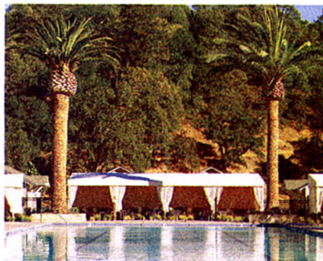
The sexy adult pool at Solage with cabanas.

and entertainment. Known for their diverse production of fine estate-grown wines from their 235 mountaintop acres that straddle the county line of Sonoma and Napa, Pride Mountain Winery ( www.pridewines.com ) provides a truly memorable tasting experience. For a nominal fee, visitors begin their tasting adventure in the main tasting room with a floral Viognier and a well-rounded Chardonnay. Outside, the mountain and valley views are stunning, with seemingly endless rows of vines that stretch beyond the horizon. A tasting guide also delivers you inside their 23,000 square foot labyrinth of caves, where the barrel aging process is in full swing, as you sample some of their fruit-forward Merlot and cave-fermented Cabernet Sauvignon.