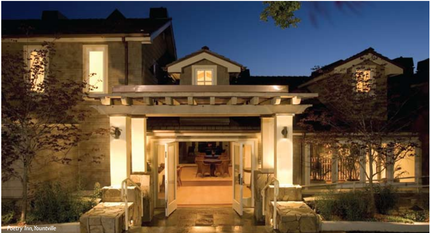
Poetry Inn, Yountville