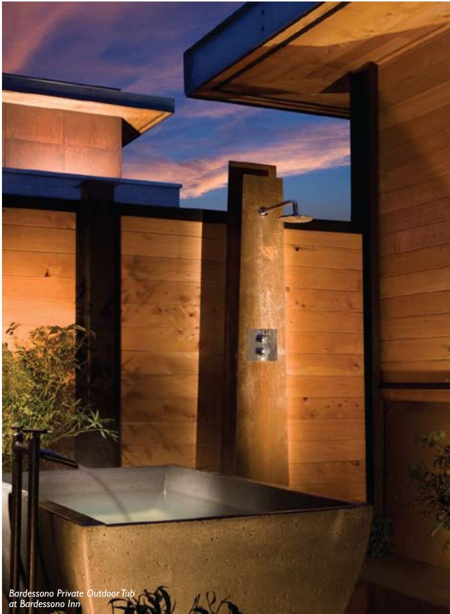
Bardessono Private Outdoor Tub at Bardessono Inn