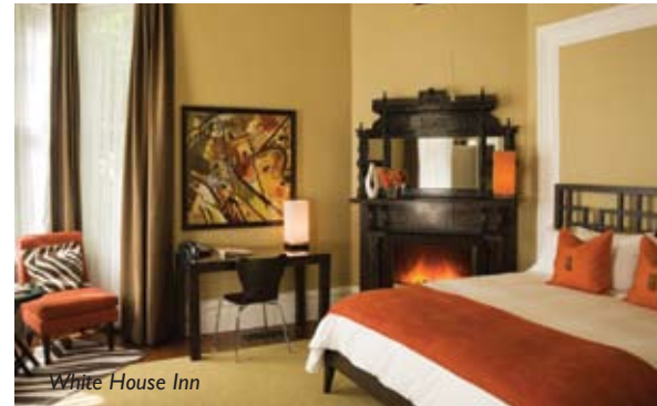
White House Inn

downtown Napa adjacent to the Napa River and Preserve. A stunning lobby, dramatic floral arrangements, and colorful artwork set the tone. Opening onto the lobby, Bank, a lounge and wine bar, serves casual meals and cocktails. The swimming pool and courtyard overlook the river.