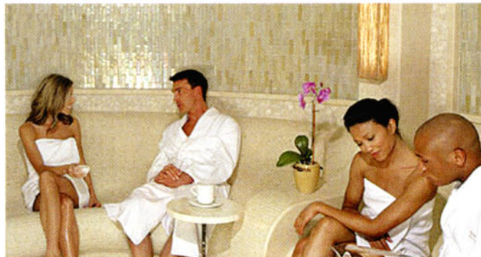
Qua Baths & Spa at Caesars Palace Las Vegas

• Allegria Spa at Park Hyatt Beaver Creek (Colo.) Following a recent $12-million rejuvenation and expansion, the 30,000-square-foot, 23-treatment-room spa features the Aqua Sanitas water sanctuary, with a co-ed mineral pool as well as private spaces and deluxe spa locker rooms that offer additional hot and cold spa options. The self-guided water ritual, which is ideal for groups, is included with every treatment in the spa and costs $20 à la carte for hotel guests. It is infused with essences of indigenous Colorado wildflowers and herbs