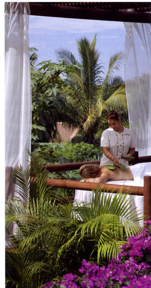
Alpine Spa, Four Seasons Resort Punta Mita