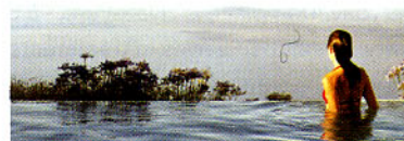
Over the top: Pacific views beckon at Big Sur's Post Ranch Inn.